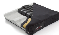
ROHO® Hybrid Elite® Cushion