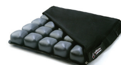
ROHO® MOSAIC® Cushion