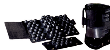
ROHO® HEAL PAD® Cushion