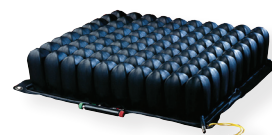
ROHO® QUADTRO SELECT® HIGH PROFILE® Cushion